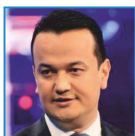
Laziz Kudratov, First Deputy Minister, Ministry of Investments and Foreign Trade of the Republic of Uzbekistan

10:40 – 11:00 Presentations on Economic Reforms and Trade